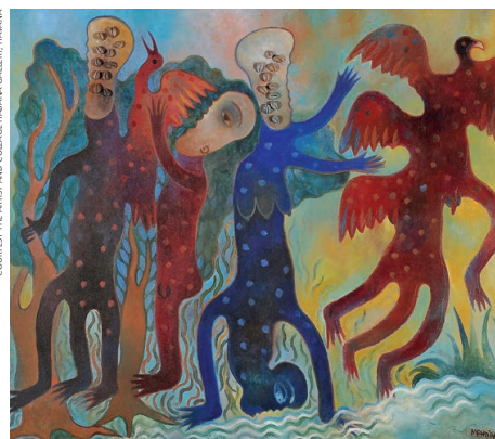
Manuel Mendive's The Waters , 2008, at Collage Habana Gallery